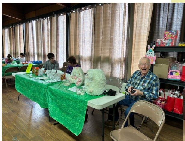
Easter Bunny visit