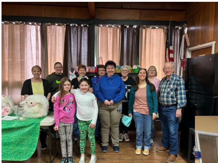
Spring Fling/Easter Egg Hunt volunteers