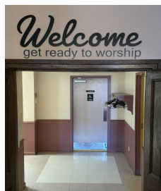
As you come in the front door.