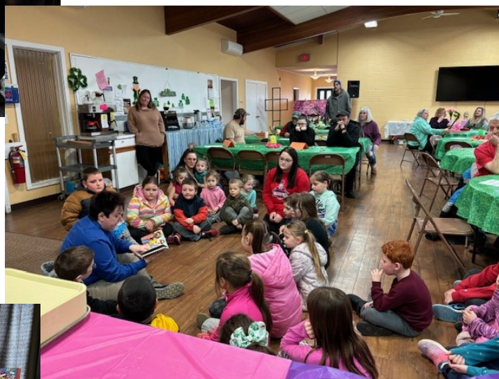
Guessing game prizes